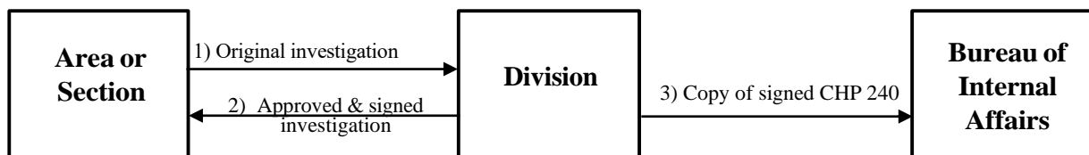
Figure 8c Category II Investigation Routing Diagram - Division as Approving Authority

(9) Figure 8c is a simplified representation of the routing of a typical Category II investigation that requires Division approval.