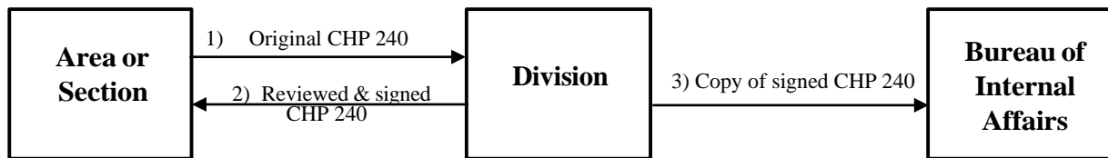
Figure 8b Category II Investigation Routing Diagram - Area as Approving Authority

(9) Figure Sb is a simplified representation of the routing of a typical Category II formal investigation that does not require Division approval.