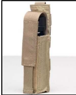
Picture 6-81 Point Blank Holster, Aerosol Projector