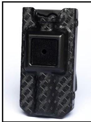
Picture 6-69 Tourniquet Carrying Case