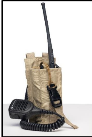
Picture 6-84 Safariland Radio Pouch