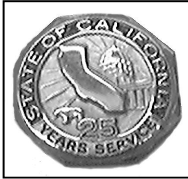
Picture 6-34 25-Year Service Pin