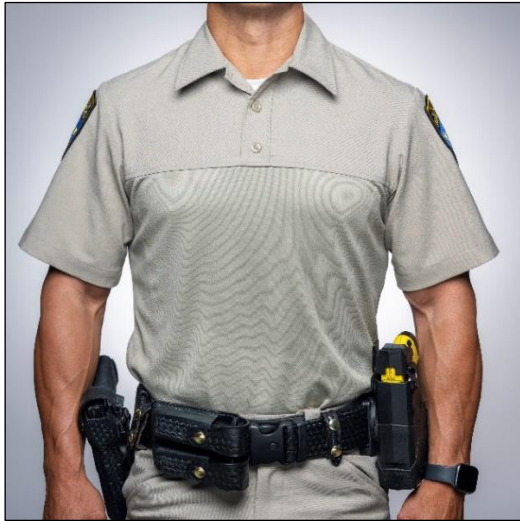
Picture 6-90, Base Layer Uniform Shirt, Short-Sleeved