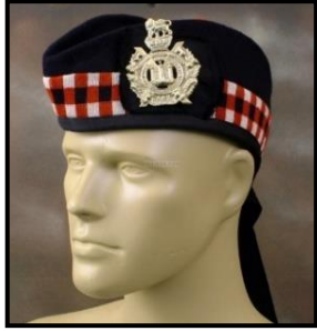
Picture 6-67 Glengarry