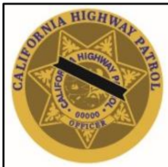
Picture 6-43 Memorial Pin