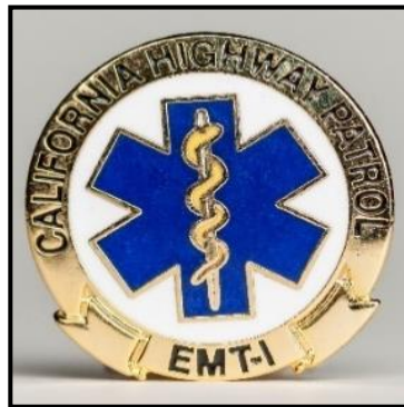
Picture 6-36 Emergency Medical Technician-I Pin