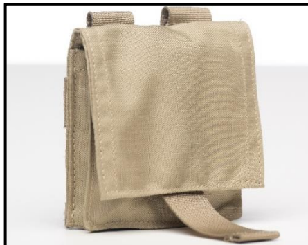
Picture 6-86 Safariland Handcuff Case