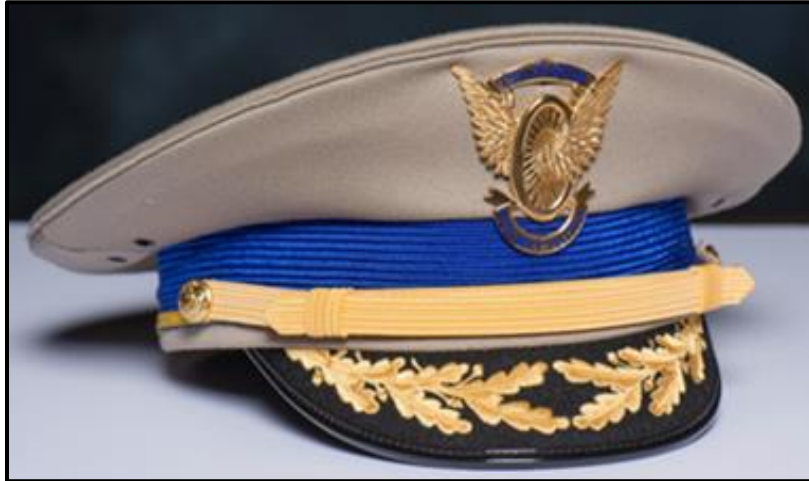
Picture 6-1 Cap—Summer (Cane Side)—Commissioners, Chiefs, and Assistant Chiefs