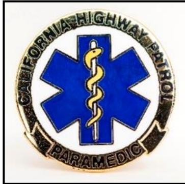
Picture 6-35 Emergency Medical Technician-Paramedic Pin