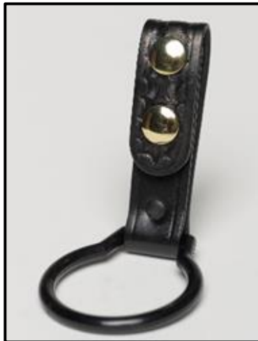
Picture 6-27 Flashlight Ring