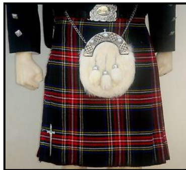
Picture 6-63 Kilt Pin