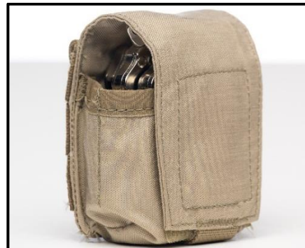
Picture 6-87 Point Blank Handcuff Case