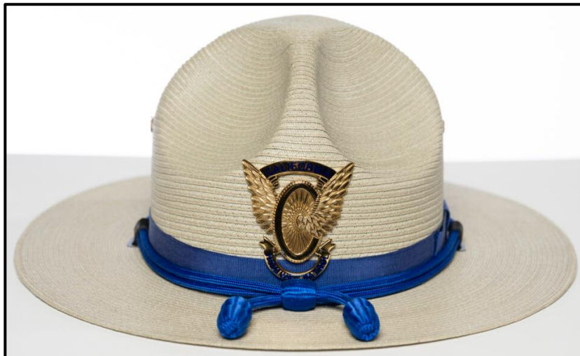
Picture 6-2 Straw Campaign Hat