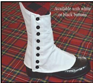
Picture 6-62 Spats