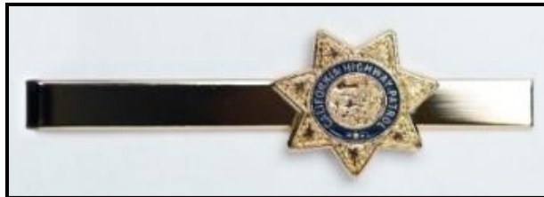
Picture 6-30 Tie Bar