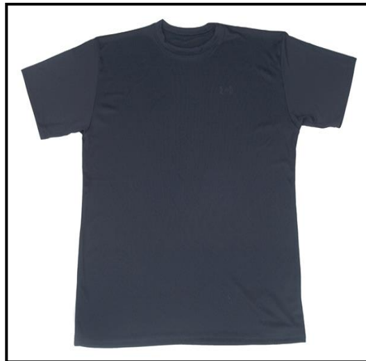
Picture 6-59 Blue Undergarment Shirt