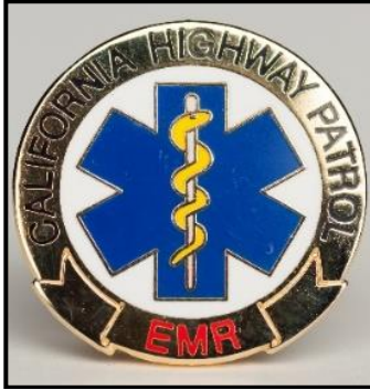
Picture 6-37 Emergency Medical Responder Pin