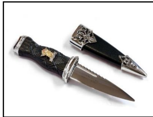
Picture 6-66 Sgian Dubh