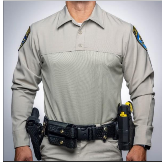
Picture 6-91, Base Layer Uniform Shirt, Long-Sleeved