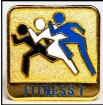
Picture 6-39 Annual Fitness Challenge Pin

(2) Color . Gold, blue, black, and white.