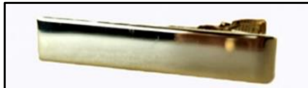
Picture 6-29 Tie Clasp