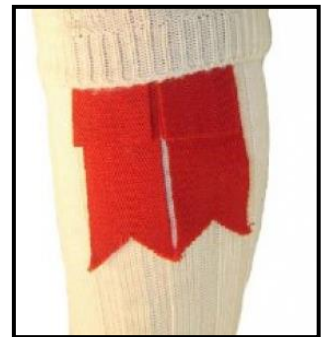
Picture 6-64 Kilt Hose with Flashes