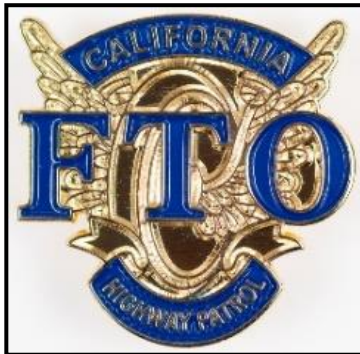
Picture 6-38 Field Training Officer Pin