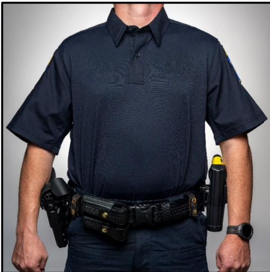
Picture 6-88, Base Layer Uniform Shirt, Short-Sleeved

(b) Women: Long- and short-sleeved ranging from extra small to XX-large, regular length, women's fit.