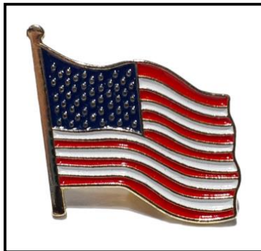
Picture 6-40 United States Flag Pin