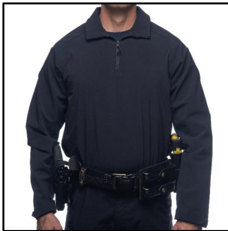
Picture 6-92 Softshell Pullover

(b) Style . Soft brushed fleece insulated arm, shoulder, and collar. Non-insulated body. Fade, shrink, and wrinkle resistant. High raglan sleeve construction. Split yoke. Running side gusset for maximum movement and 1/4 zip front placket. Longer body length without bottom slit stays tucked in. Adjustable hook and loop cuff closure. Bar tacks at all stress points. Internal locker loop and ID write bar inside. Fold-down collar. 1 in. drop on shirt back. Straight hem, internal locker loop, embroidered logo, zip through front neckline.