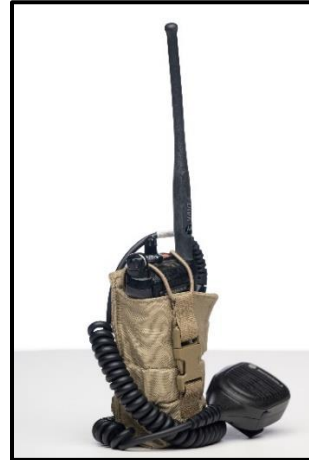
Picture 6-85 Point Blank Radio Pouch