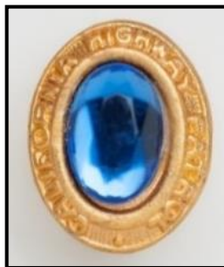
Picture 6-31 Tie Tack