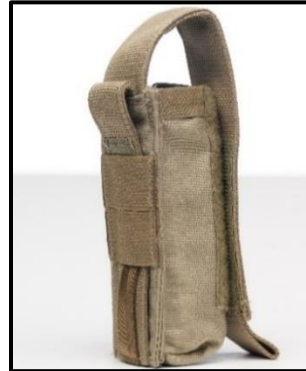
Picture 6-82 Safariland Holster, Aerosol Projector