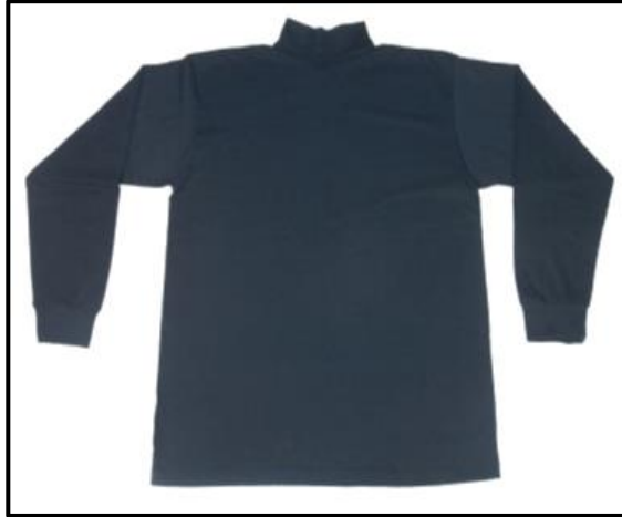
Picture 6-21 Mock Turtleneck