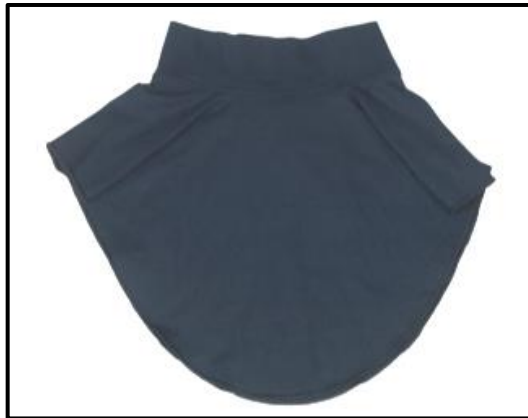
Picture 6-22 Mock Dickey