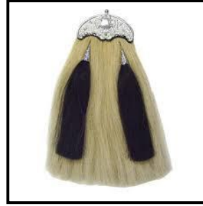
Picture 6-68 Horsehair Sporran