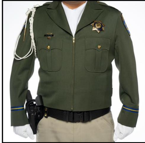
Picture 6-23 Honor Guard Accouterments