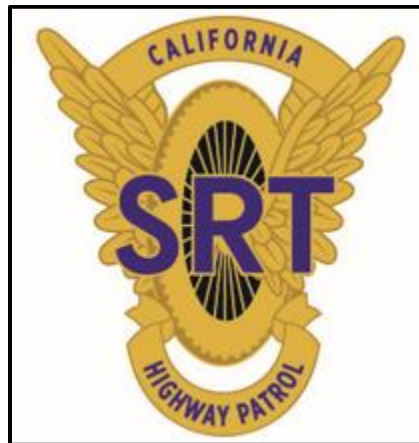
Picture 6-45 Special Response Team Pin

t. Multidisciplinary Accident Investigation Team Pin.