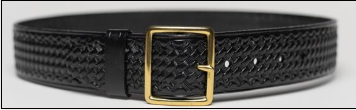
Picture 6-58 Brass Buckle Trouser Belt