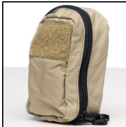
Picture 6-83 Point Blank Medical Pouch