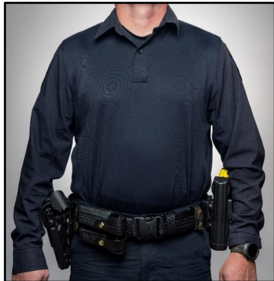
Picture 6-89, Base Layer Uniform Shirt, Long-Sleeved