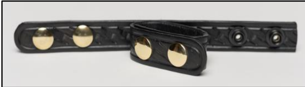
Picture 6-26 Belt Slide Loop