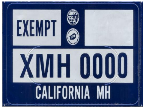
Exempt Fees (actual size)