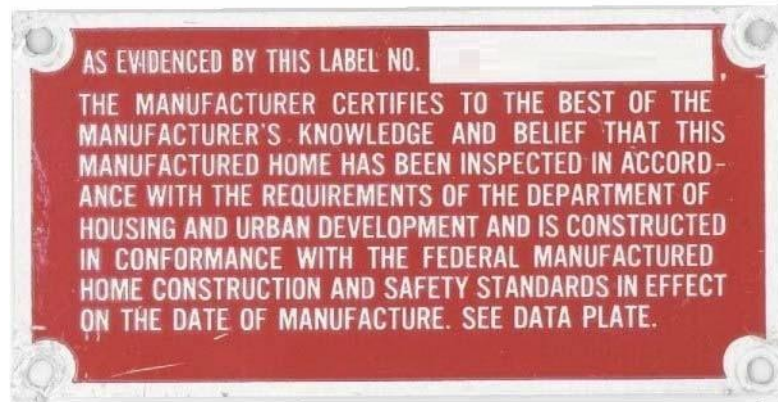
Figure 7-2, Federal Identification Label

(2) Commercial Coach Identification . Single and multiple unit commercial coaches manufactured in CA for sale after September 7, 1973, may be identified by a permanently affixed label issued by the HCD. An example of such label is shown in Figure 7-3.