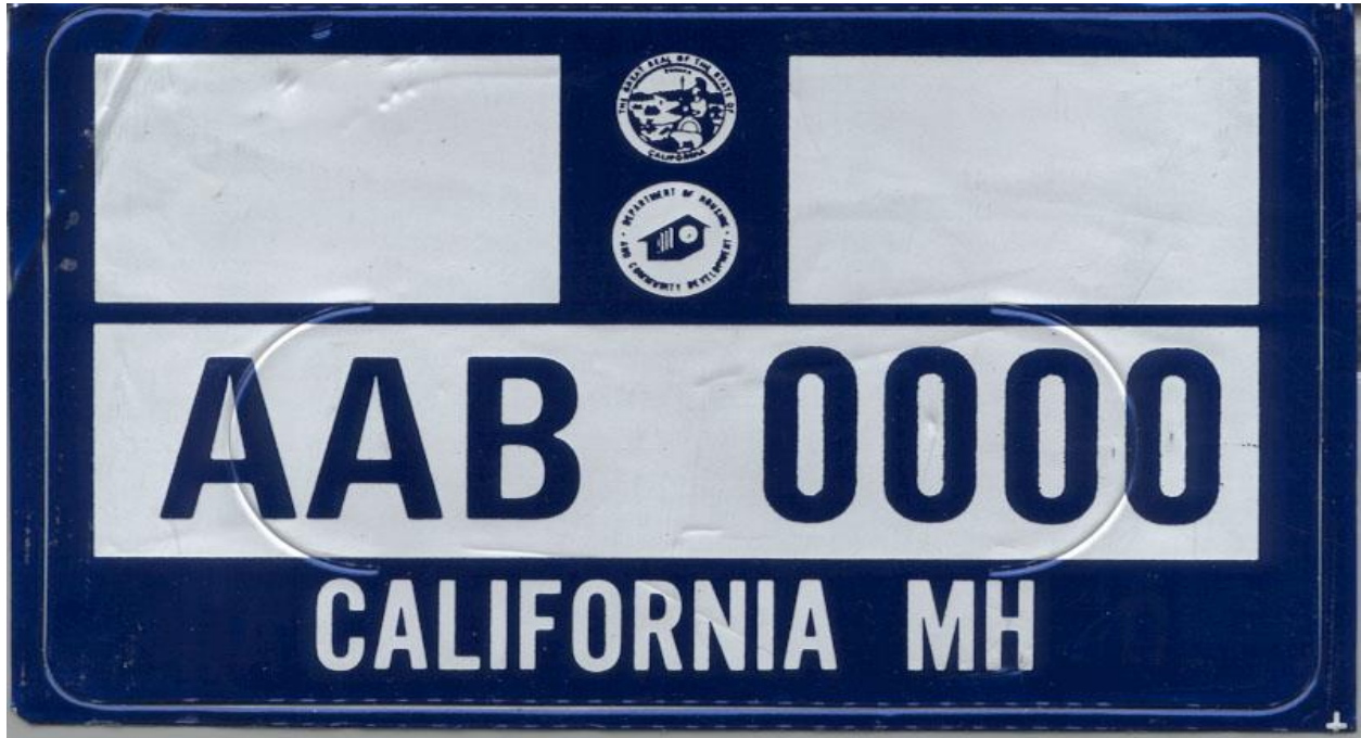
Annual Registration (actual size)