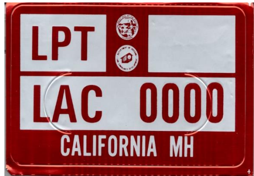
Local Property Tax (actual size)