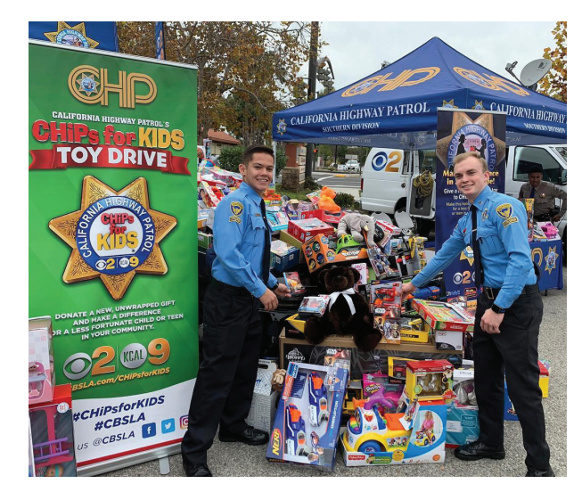
Make a difference in your community.

Like the Level III Academy, the Level IV Academy is a 6-day training course. During this training, explorers will live at the CHP Academy in West Sacramento. The Level IV Academy is exclusively reserved for CHP explorers who have successfully completed Levels I, II, and III; are at least 19 ½ years of age; and are in excellent health and physical condition. In addition to the physical training and DUI investigation training, Level IV attendees are given the rare opportunity to drive patrol vehicles on the Emergency Vehicle Operations Course.